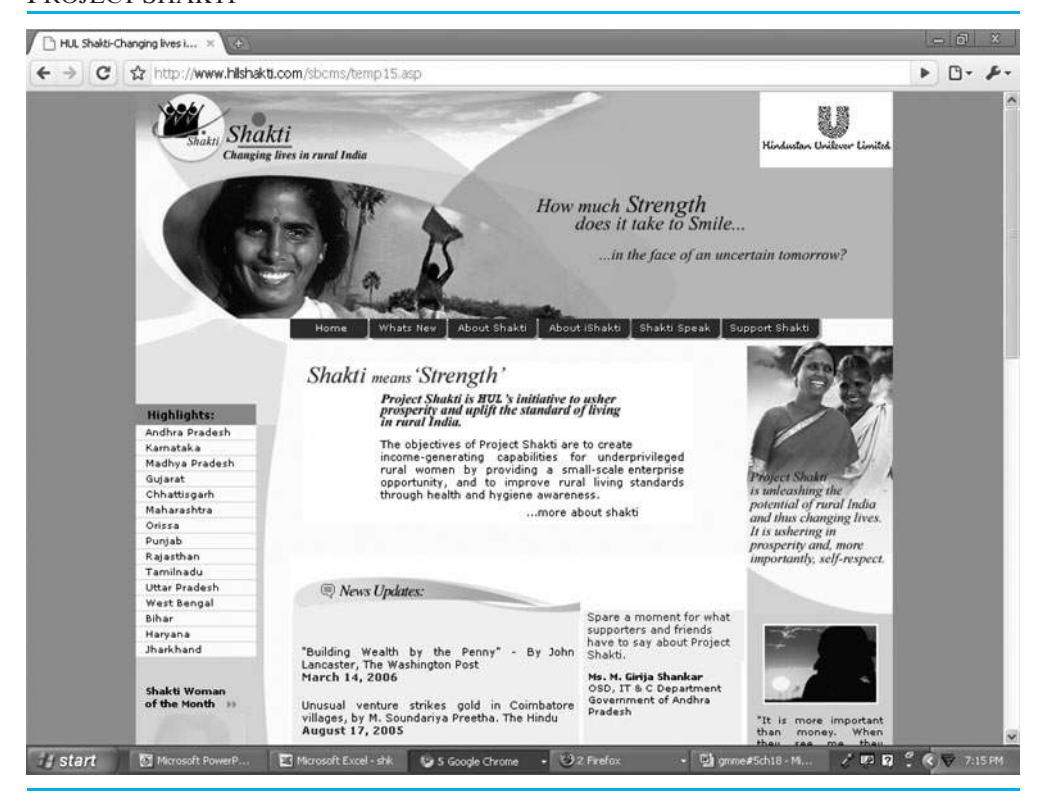
EXHIBIT 18-8 PROJECT SHAKTI