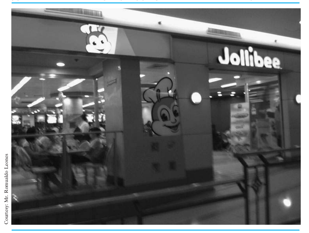
EXHIBIT 18-4 JOLLIBEE—THE LEADING FAST FOOD CHAIN IN THE PHILIPPINES

<sup>24</sup>http://money.cnn.com/magazines/fortune/global500/2008/.