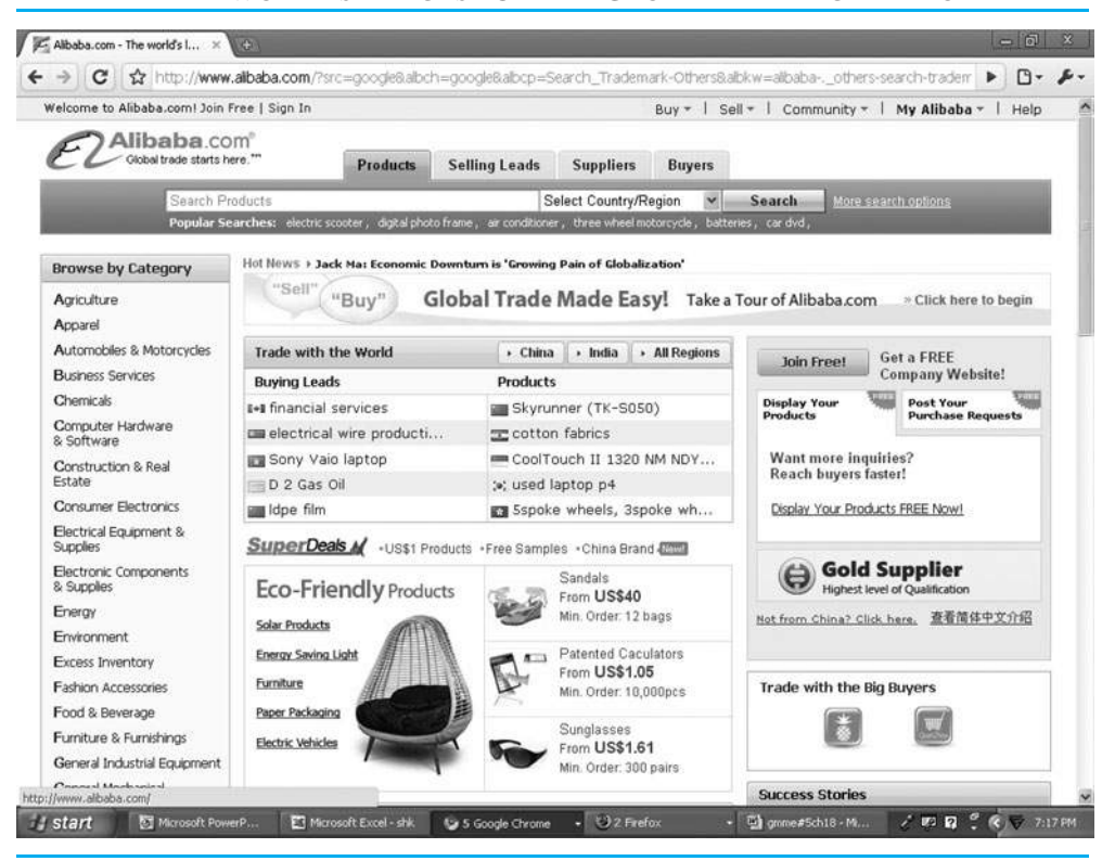
EXHIBIT 18-9 ALIBABA—THE WORLD'S LARGEST ONLINE GLOBAL TRADING PLATFORM