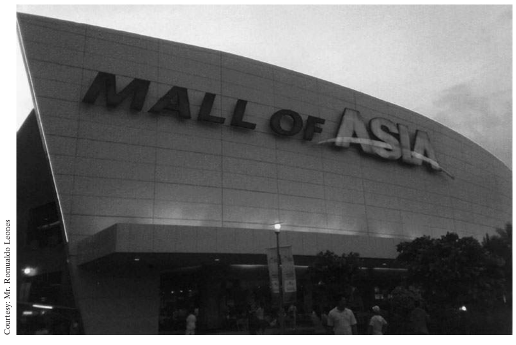
SM Mall of Asia in Pasay City, Philippines